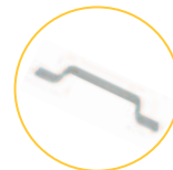
Link Bar - 2 way IP-72013